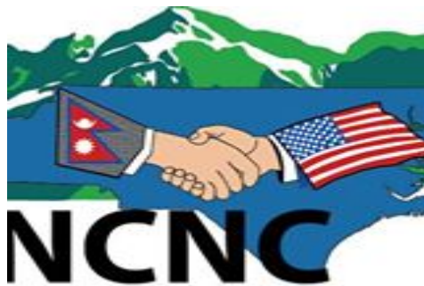
Nepal Center of North Carolina logo.